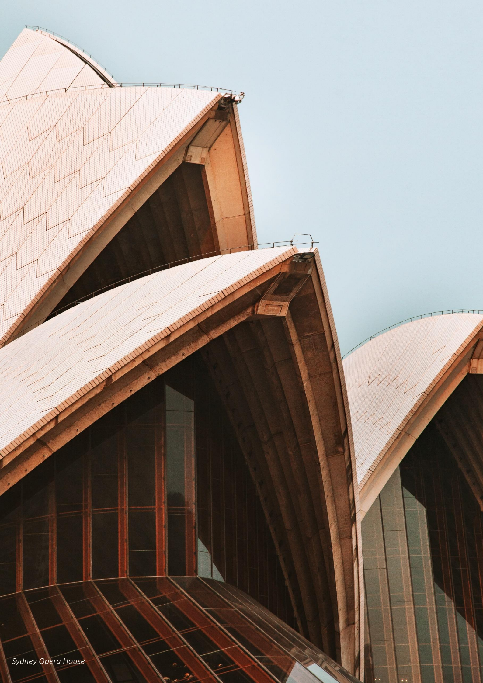
Sydney Opera House