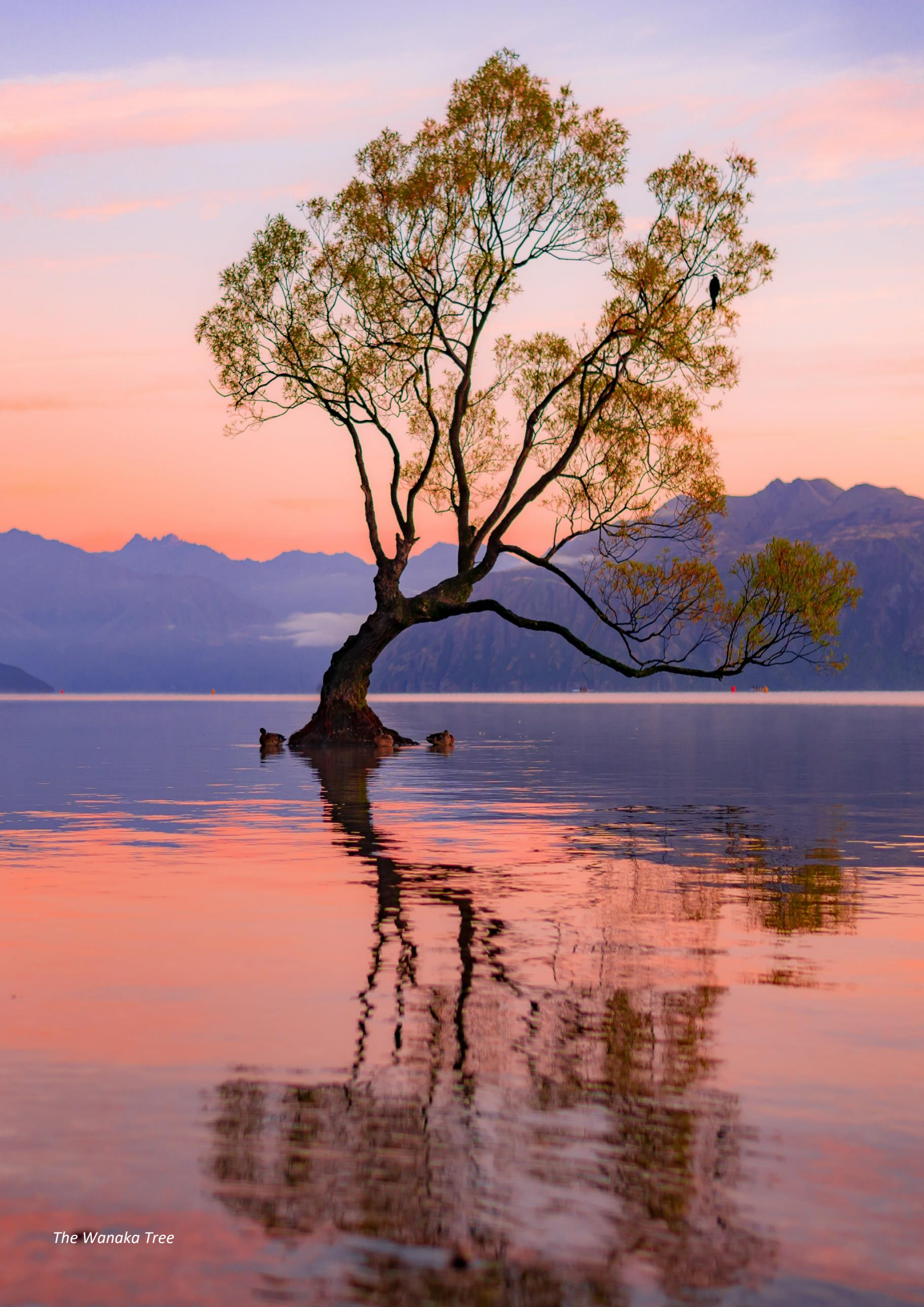
The Wanaka Tree